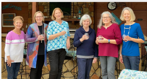
Women & Wine II, April 29