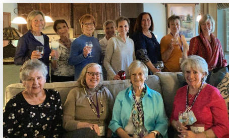
Women & Wine I, April 15