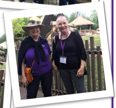
Photos from the Fort Worth Zoo outing and lunch on October 15