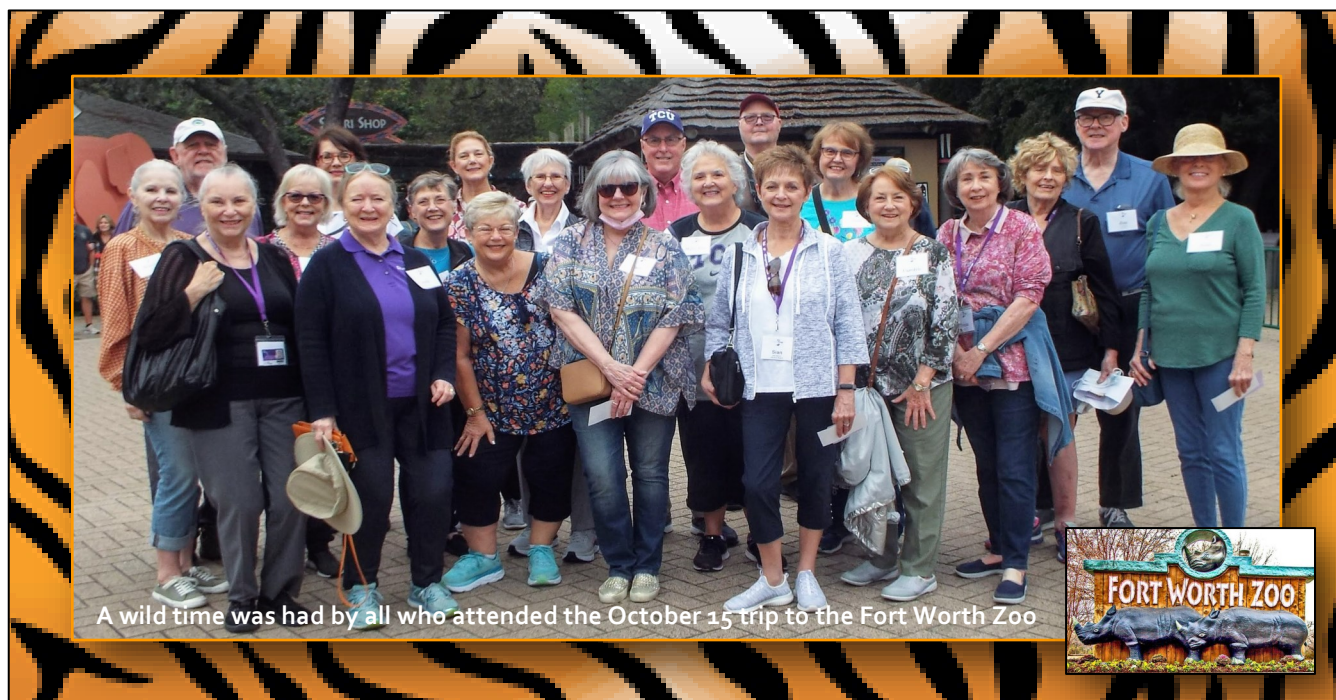
A wild time was had by all who attended the October 15 trip to the Fort Worth Zoo

A great group of Silver Frogs had a delightful time at the Fort Worth Zoo on October 15th! As you can see from the pictures, we thoroughly enjoyed the beautiful weather, feeding the giraffes, marveling at the new Elephant Springs exhibit, watching the penguins do a happy dance for their feeders and so much more. We then moved on to the Blue Goose Cantina for a delicious lunch and lots of fun conversation. I think all of us also enjoyed making a new Silver Frog friend or two—the added bonus of participating in our planned special events!