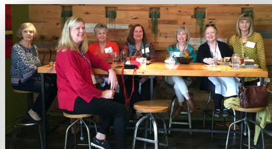
The pre-tour lunch was at Righteous Foods .