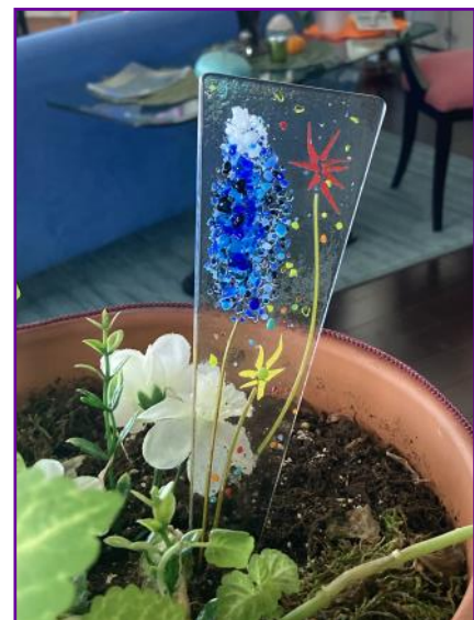
The photos show various stages of the project – creation, fired pieces, and use as a plant stake!