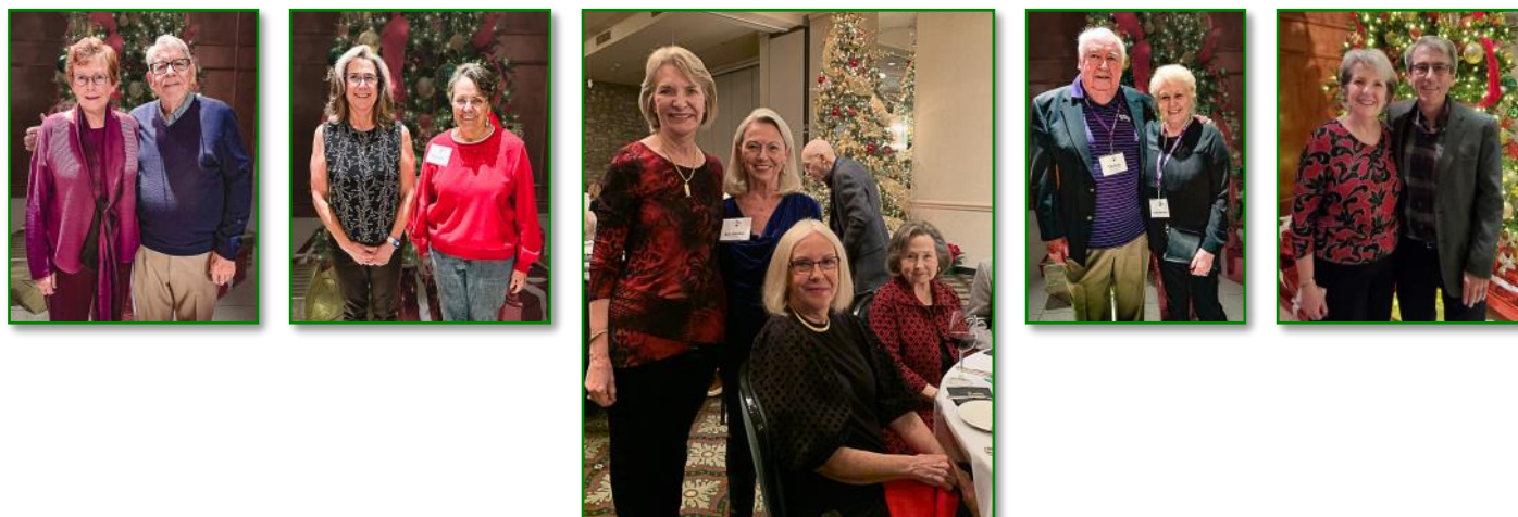
Party photos continue on page 3