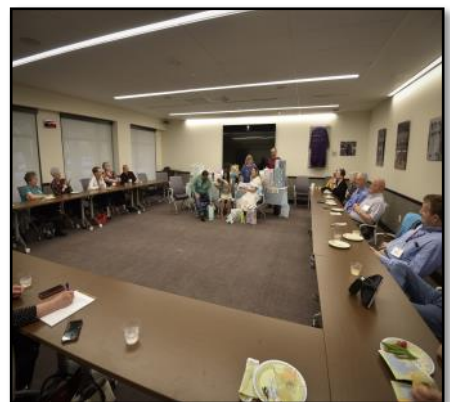
The Kelly Center took on a different vibe for a baby shower!