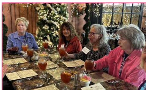
Ladies Lunch met on May 12 at the Rose Garden Tea Room inside the Mercantile on Camp Bowie in Fort Worth.