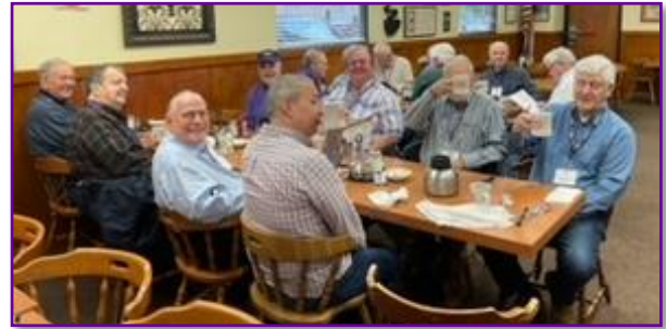
The Men's Breakfast Group meets monthly at Ol' South Pancake House on University Drive the first Friday at 8:00am. Usually numbering about 20 Silver Frogs, all male members are invited to enjoy the morning meal and camaraderie. — Gary Harrell