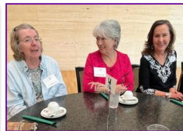
These pictures are from one of our Afternoon Tea get-togethers at the Kimbell Art Museum. We have informally added "and