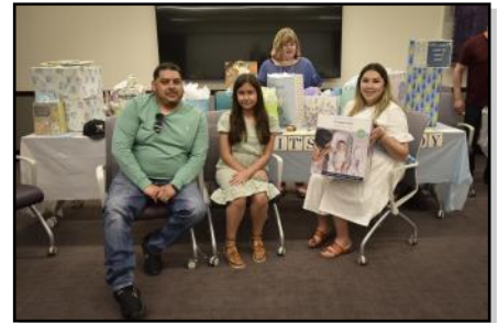
The family was extremely grateful for the generous gifts and good wishes.