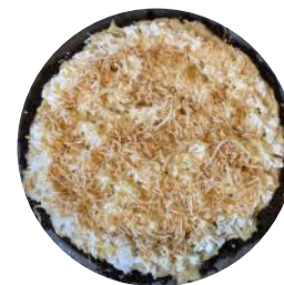
Spinach-onion tart and coconut cream pie in a chocolate crust were just two of many treats baked for Mary Dulle's Oh My, It's Pie (part 2) class.